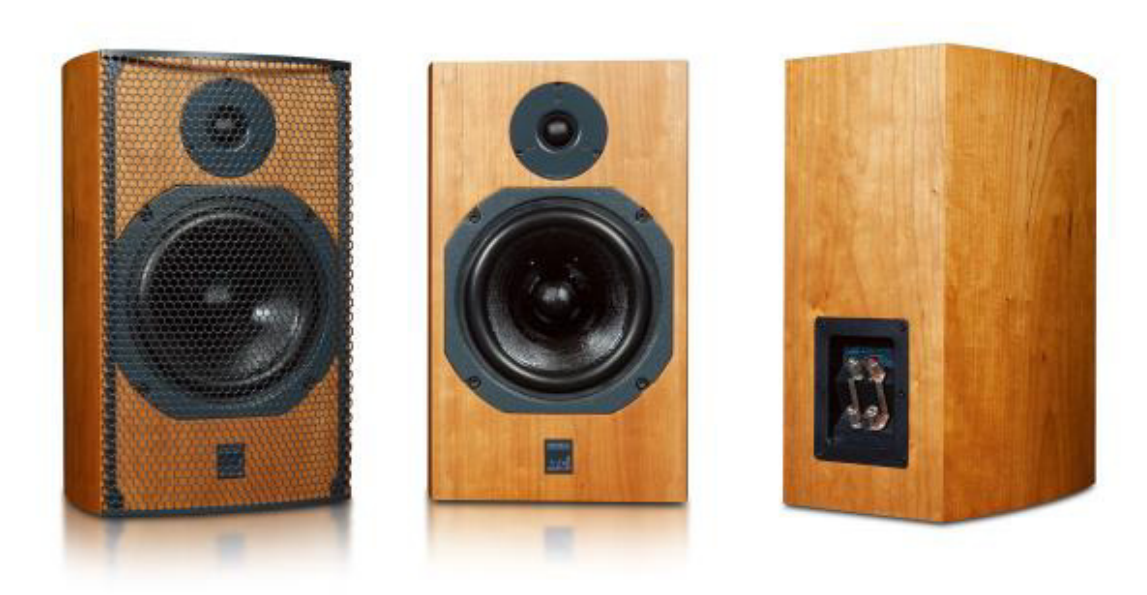
ATC SCM11 Ver.2 Price 2,600,000 won Composition 2- way 2 speaker enclosure Closed usage Unit woofer 15cm, tweeter 2.5cm Playback frequency band 56Hz-22kHz (-6dB) Crossover frequency 2.2kHz Impedance8Ω Output sound pressure level 85dB / W / m Recommended amplifier output 75-300W Size (WHD) 23.2 x 38.1 x 23.6 cm Weight 10.9 kg